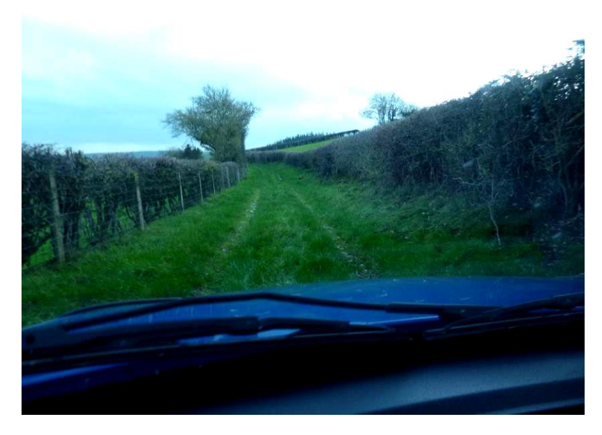
Fig.6: access to the meeting house is via a green lane through fields

The meeting house is notable for its remote location, set within farm land on the north side of the Dyffryn Meifod Efyrnwy valley and only accessible via a green lane through the fields past a farm. There is a small car park at the farm, from where Friends walk to Meeting. No other buildings are visible from the meeting house and burial ground, providing an unusually peaceful setting. The meeting house has a garden to the south, the burial ground to the east and beyond this to the east is a small wood. All these are enclosed by dry stone walls, with a rough track approach the meeting house along the south side of the wood. A path laid with small cobbles runs along the south front of the meeting house. The garden to the south of the building is lawned with shrubs and plants.