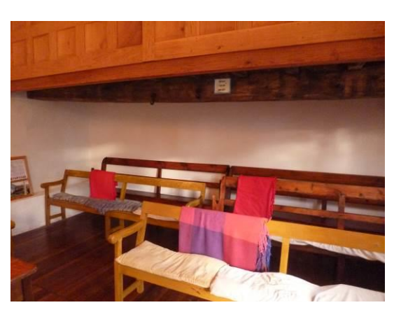
Statement of Significance

Dolobran meeting house is a fine example of a vernacular Welsh meeting house built in a rural location in c1700; it has exceptional significance as the earliest purpose-built meeting house in Wales, although not in continuous Quaker use. The site is important for the adjoining burial ground, the setting and the building, which retains its plan-form and overall character. It has recently been acquired by Friends who cherish its simplicity and heritage.