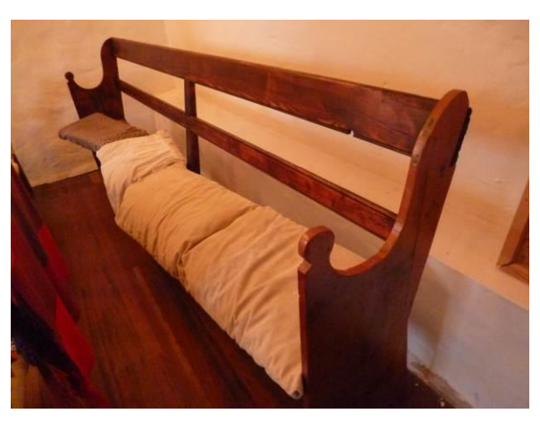
Fig.4: benches brought from other meeting houses during the late 20th and early 21st centuries