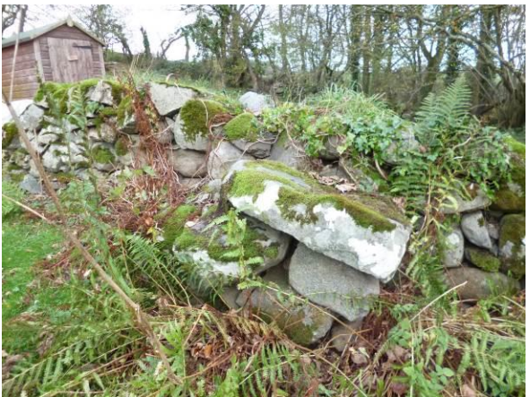
Fig.5: south wall to burial ground east of meeting house (left), and remains of mounting block against west wall (right)