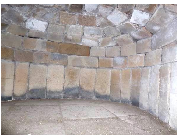
Fig.3 bread oven in cross wall between cottage and meeting room; inside the oven (right)